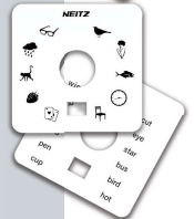
Two types of fixation card ( Fixation Card Set RX ) * Optional